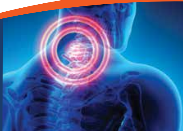
Image-guided diagnoses and treatments are now available for every organ system within the body. Many of these therapies are new, and offer exciting advantages to both patients and providers. We are happy to answer any questions you have about our procedures and are always available to consult with your doctor to help determine if one of our minimally invasive treatments is right for you.